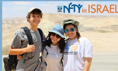
A once-in-a-lifetime chance to hike, climb, discover, and explore Israel with friends for life.