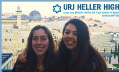
Transform your education with the most experienced high school program in Israel.