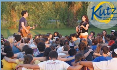
Expand your creative arts, songleading, and social action skills at NFTY's summer home.

Teens who attended NFTY Convention can receive $200 off one of these programs. Use code NFTYCon17 by March 15